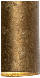
AGED GOLD LEAF